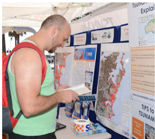
Using local maps should be part of community-based planning for a tsunami.