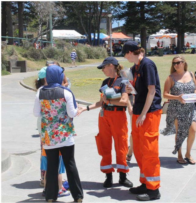
NSW SES personnel speaking with people about the tsunami risk in their local area.