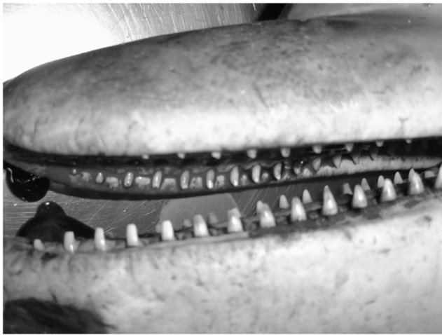
Figure 4. Tooth wear of the Southern Australian bottlenose dolphin in Port Phillip Bay. It can be seen that there is very low levels of tooth wear present. doi:10.1371/journal.pone.0016457.g004