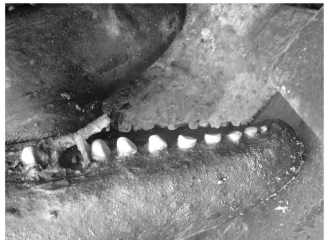
Figure 3. Tooth wear of the Southern Australian bottlenose dolphin in the Gippsland Lakes. It can be seen that the teeth are highly worn towards the front of the jaw. doi:10.1371/journal.pone.0016457.g003