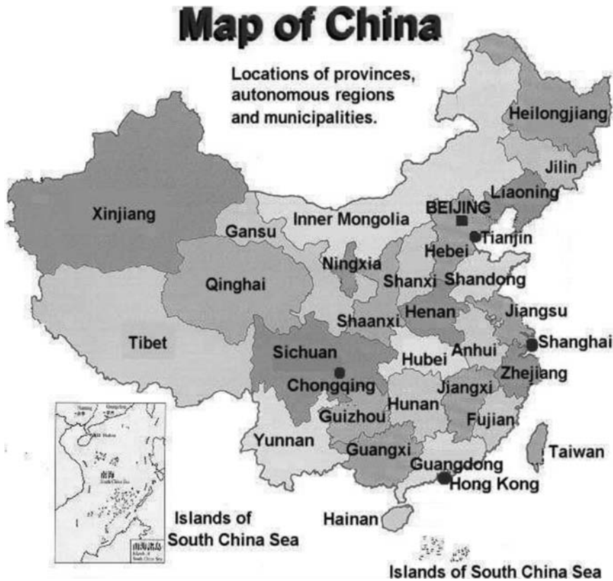
Figure 1: Provinces, Autonomous Regions and Municipalities in China