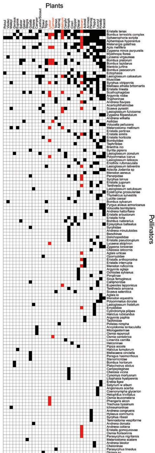
Figure 2. Plant–pollinator network of 33 flowering plant species and 132 pollinator species. Pollinators and plants are in rank order according to their number of links. Filled boxes indicate interactions observed between a plant and pollinator species (1911 total links). Four focal plant species for the breeding system and pollen supplementation experiments that were pollinator dependent are highlighted in red.

that consider similar sampling methodology are necessary to provide the robust baseline data we need for conservation.