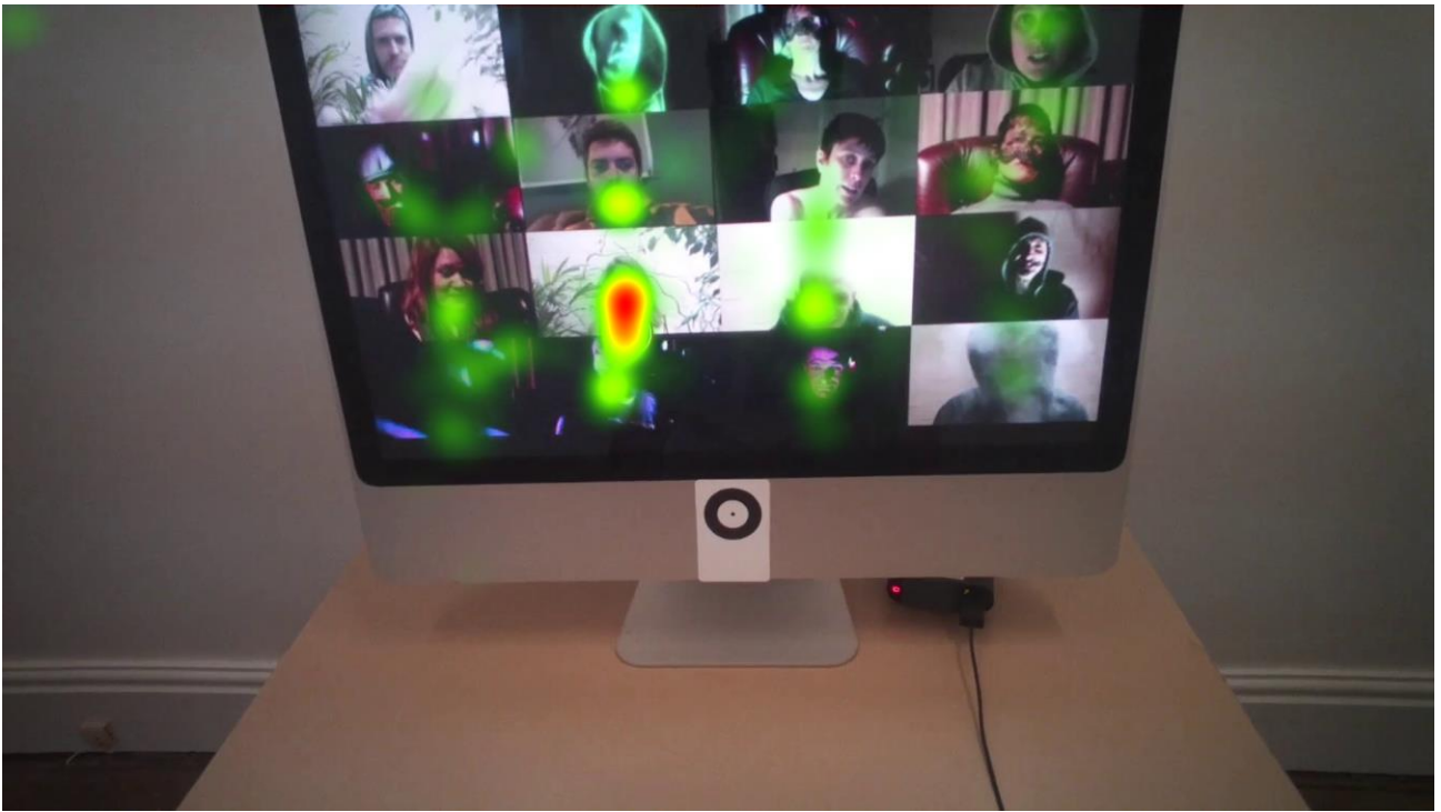
Indicative participant eye-tracking data from the last scene of the original video used in Only the Envelope with eye-tracking data represented as a heat map. Vahri McKenzie, Only the Envelope reenactment video still.