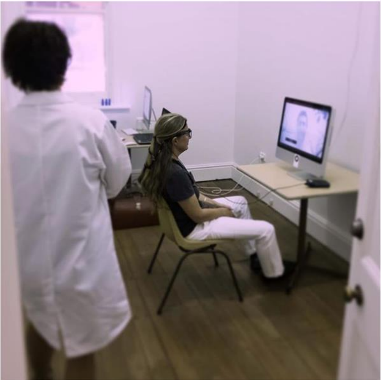
Installation view, Vahri McKenzie, Only the Envelope .