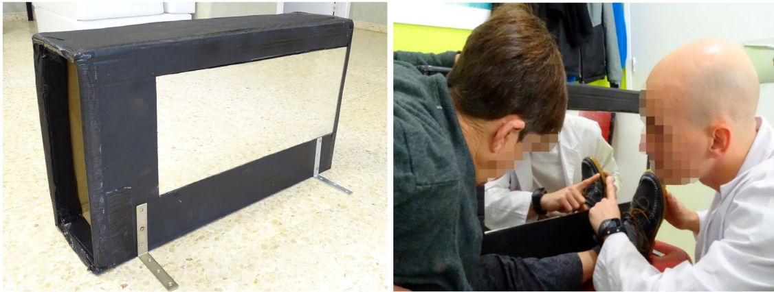
FIGURE 2 Pictures of the mirror box used and a treatment session