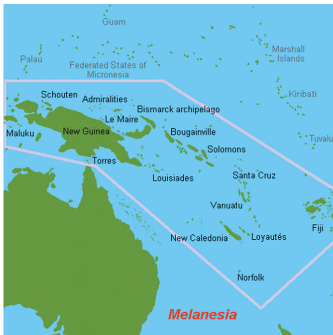
FIGURE 1. Map of Countries of Participants.

The education program was developed following the general principles of the World Health Organization Mental Health Gap Action Program (WHO, 2010): Communication with people seeking care and their carers; assessment; treatment and monitoring; mobilizing and providing social support; protection of human rights; attention to overall well-being; and