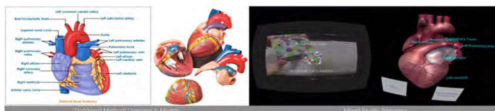
Figure 1. Pedagogies for teaching anatomy with a heart diagram/model

The case study for this paper will be a MR system integrating spatial learning analytics for facilitating the learning of anatomy by health science and medicine students through a visualisation of the human heart. An example of the relative traditional and MR pedagogies is shown in Figure 1.