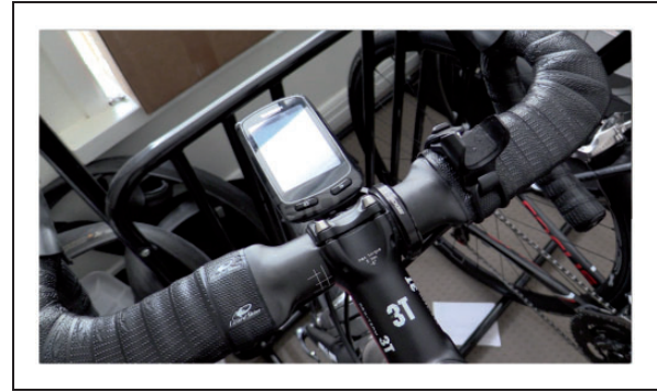
Figure 1. A handlebar-mounted Garmin computer.

The research encounter therefore made mundane experiences that matter apparent by creating a context where they could be attended to and accounted for in ways that went beyond verbal or observational research. We sought to accompany participants into sites of their mundane to research and understand them, rather than standing at the edge through an interview or survey. An anthropological ethnography of