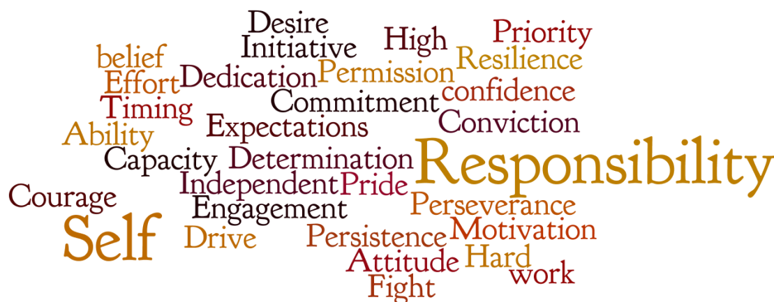
Figure 2: Sub-theme II model of student personal attributes for success.

Critical to the success of Indigenous students, irrespective of the available support, was timing. This included the timing of undertaking the nursing course and studying in relation to their family and community roles and responsibilities. Timing also extended to the complexity of their social needs such as housing, income, and childcare, and the personal health of the students, their families, and communities. “There’s [sic] certain social reasons ... they’ve just been on struggle street, you know, emotionally for so long that it becomes overwhelming. And sometimes, time is the only thing that helps” (IA).